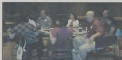
The Hebrew High teachers prepare for another great year.

It's not too late for your student to get started on the road to Jewish learning, leadership, and success. Please call or email today to start a lifelong love affair with Jewish learning and the Jewish people. ✪