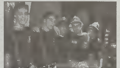
The boys of Mickey Barack Aberman AZA.

Mickey Barack Aberman AZA is one of the two boys BBYO chapters in Charlotte. Our chapter has been active for over 30 years. MBA members are also very committed to our Region and serve on the NC Council Board.