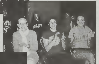
Above, left, and below: Hebrew High students participated in an all-school tefillah service that everyone enjoyed.