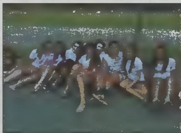
The girls of Ohavim BBG.

September was an amazing month for Ohavim BBG. We started off the month with a fantastic joint program with our sister chapter, Chai Chaverim BBG. This was our first program with the current MIT (Members-In-Training) class, and it was a huge success. The following week, we had the annual chapter visit program. All of the MITs spent 45 minutes with Chai Chaverim and 45 minutes with Ohavim. This way, they could get a feel for each chapter and have a better idea of where they would like to be. The following week, September 20, we had a joint games program with Chai Chaverim BBG.