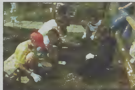
Friendship Circle participants learn how to plant a garden during Friendship Circle's summer program.