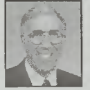
Marshall Queenstowne Realty 704-517-1073