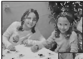
The fun at the Ballantyne Jewish Center started even before Purim day.

Over 30 children enjoyed a pre-Purim fun day at the Ballantyne Jewish Center. Activities included baking hamantaschen filled with chocolate chips, jelly or even brownie mix. Baking was followed by fun games and mask decorating.