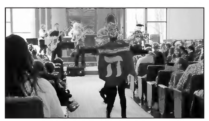
TBERS Chanukah celebration.