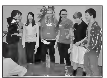
Hebrew High students always have fun while they are learning.

The Torah teaches us about everything, including how to negotiate the difficult world of love, relationships and sexuality. Using stories from our sacred books, this class will examine human relationships and what we