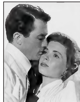
A scene from "Gentleman's Agreement"

If you are watching them for the first time or the tenth, the experience is always better to share with a community of film lovers. Please join us and bring a friend. ☆