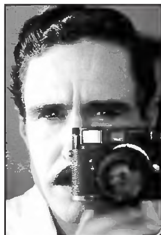
John Shea stars in "The Impossible Spy" (Eli Wallach also stars)