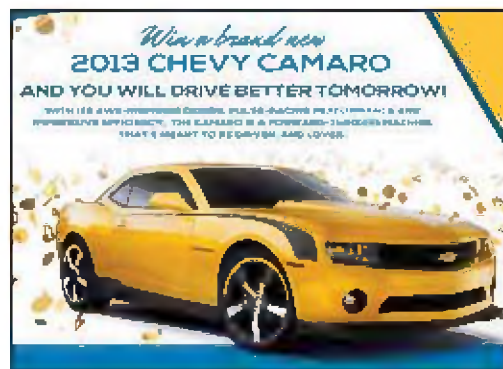
First prize is a 2013 Chevy Camaro.

"The Drive for a Better Tomorrow" is a unique raffle campaign that gives a chance to every raffle ticket holder to win one of three spectacular prizes including: a 2013 Chevrolet Camaro Coupe LS, a seven day dream trip to Israel for two, and nice cash prizes.