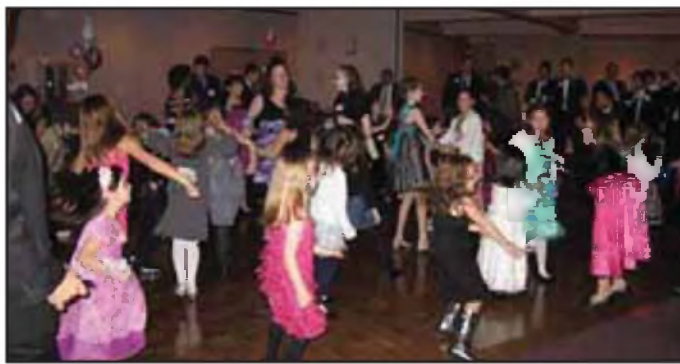
Dancing the night away at the dance in 2010.

Dads, get ready to shine your shoes and buy your daughters party dresses for the third annual Father-Daughter Family Dance brought to you by the Men's Club. The dance is Saturday, December 15 from 6:30-9:30 PM at Temple Israel. The price is $25 per father/daughter ($10 each extra daughter) and you can send an email to events@templeisraelmen.com to reserve your spot or to get more information. Don't miss the social event of the season. ☆