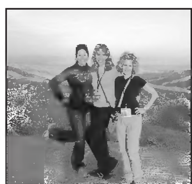
The Moms visit the Judean Hills.

We are getting ready to walk to the Western Wall and have our Shabbat meal in the Old City. It