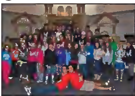
Last year's Hatikvah Kallah was lots of fun. Don't miss out on this year's!

Many TBE families are opening up their homes to host the teens while others are donating their time to volunteer throughout the weekend. Brotherhood and Sister-