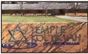
Dedication Ceremony April 14, 2013 at 605 South Street in Davidson

Temple Kol Tikvah of Lake Norman, invites the public to attend the dedication of the congregation's new synagogue at 605 South Street in Davidson on Sunday, April 14 at 1:30 PM. The temple is the first synagogue located between Charlotte and Statesville.