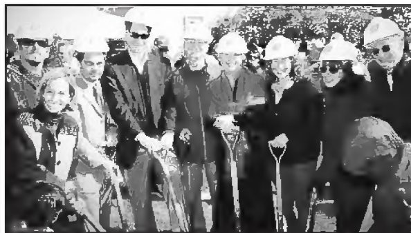
Left: the original groundbreaking for Temple Beth El on Providence Rd.; right, the more recent groundbreaking for the expansion in Shalom Park.

well as the growth of our religious school, adult education, and interfaith outreach programs.