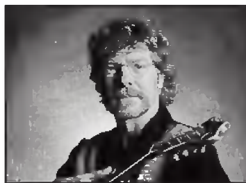
Headliner Sam Bush.

May 17-19, Misty Meadows Farm, Weddington, NC. ☆