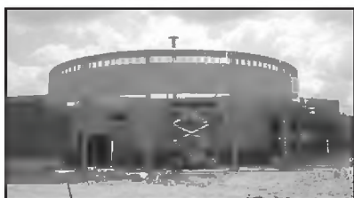
The construction continues.

For some of us, this commandment may be one of the most important teachings of our Torah. For others, it may be the Sunday School lesson our parents made sure we adhered to during long car trips or family vacations. Our lives present us with many opportunities to perform this mitzvah of “Honor thy father and thy