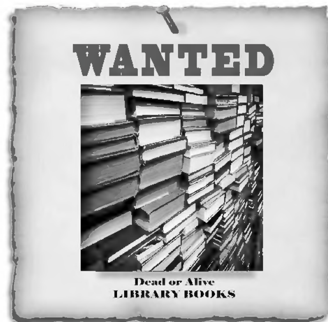
Dead or Alive LIBRARY BOOKS June is the month to bring them back home to the Levine-Sklut Judaic Library