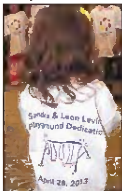
The back of the commemorative T-shirt from the dedication.