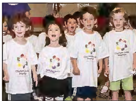
The four-year-olds sang during the dedication.