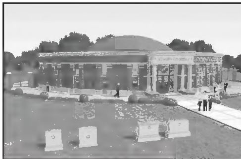
An illustration of the Memorial Building, now under construction.