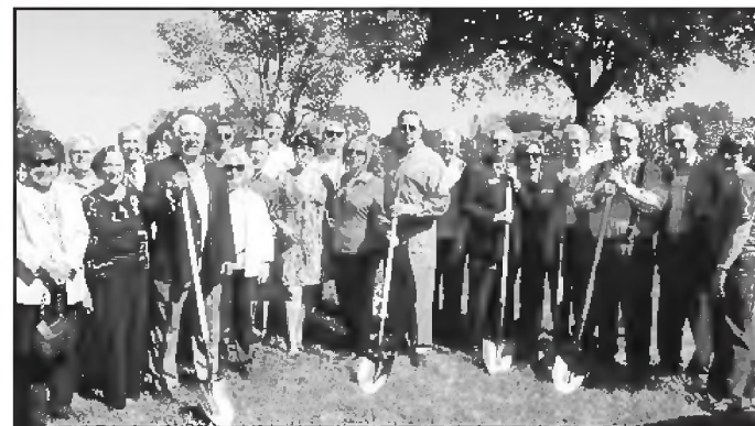
The cemetery donors at the groundbreaking.

The Annual Memorial Service is a special time to honor, embrace and remember those of our loved ones who are no longer with us. In the spirit of repentance and renewal, visiting the graves of