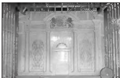
Temple Beth El's marble ark in place at the new cemetery building.

beloved relatives or other Tzadikim (righteous people) inspires us to live in accordance with our ancestors' ideals.