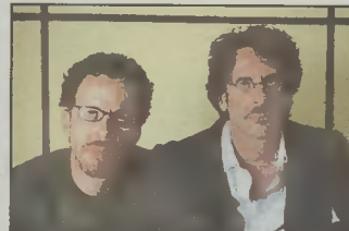
Filmmakers and brothers, Ethan and Joel Cohen.

www.beth-el.com or call 704-366-1948 for more information. ☆