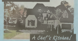
A Chef's Kitchen!