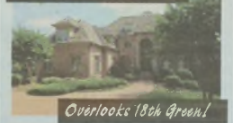
Overlooks 18th Green!