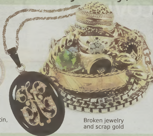
Broken jewelry and scrap gold

Do not clean your coins, it may lessen their value!