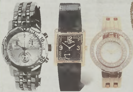
Patek Philippe, Rolex, Vacheron Constantin, Piaget, Cartier, Omega and much more!

We buy watches, even if they are no longer ticking.