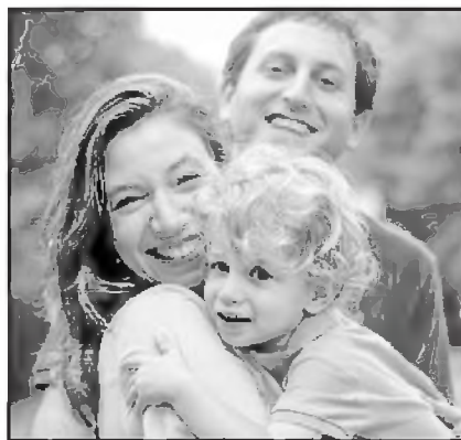
The Osovski family.

My husband and I are not religious at all; if anything, we consider ourselves very secular. Thus