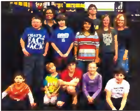
The younger students come to meet everyone at Sky High Sports.

Here are a few pictures from our 10th winter Shabbaton. ☆