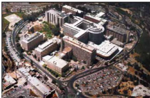
Hadassah Medical Center, Jerusalem.

If you have any questions or concerns, please do not hesitate to call me 704-844-8624. ☆