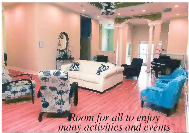
Room for all to enjoy many activities and events