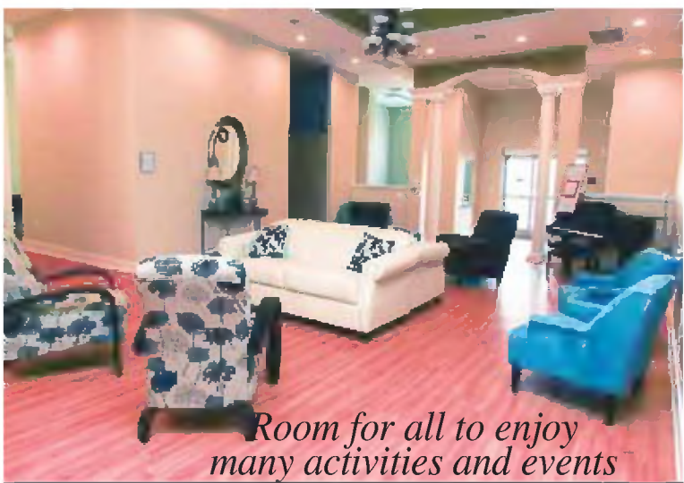
Room for all to enjoy many activities and events