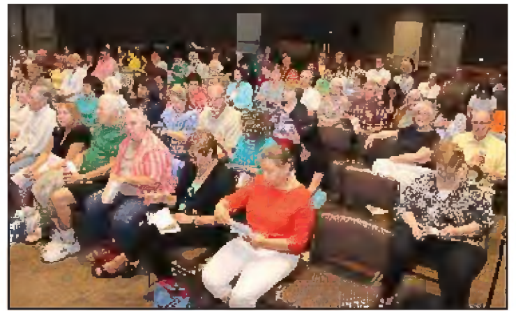
Lots of film festival fans came to be appreciated on CJFF's Fan Appreciation Day

The last movie of the day at 7 PM was an encore presentation of one of the most popular films of the 2014 CJFF. When Jews Were