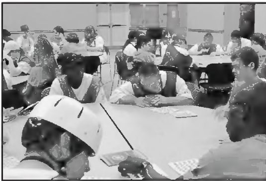
Campers at Camp SOAR play games as well as sports.

One of the camper's favorite parts of the Camp is the arts and crafts led by Eileen Schwartz. The campers always participate in art projects that incorporate commu-