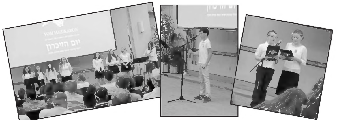
Above, from the Yom HaZikaron Commemoration

On Sunday evening, April 26 the community joined together to celebrate Yom Ha'atzmaut, Israel Independence Day. The audience enjoyed delicious falafel and the music of Mika Karni and the Kol Dodi Ensemble. People of all ages were clapping their hands and stomping their feet to the Israeli folk melodies. ✨