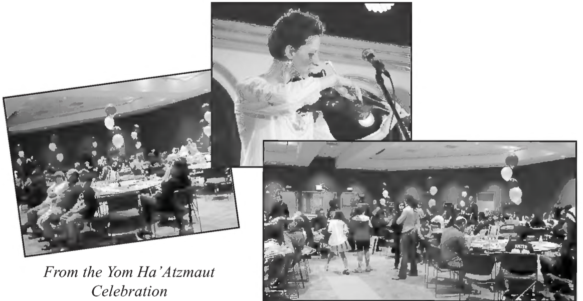
From the Yom Ha'Atzmaut Celebration