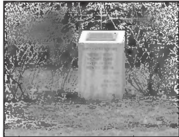
The Holocaust Memorial in Marshall Park

Editor's Note: For a story on the Memorial go to: http://www.wsocvtv.com/news/news/local/holocaust-memorial-often-overlooked-marshall-park/nXDqg/