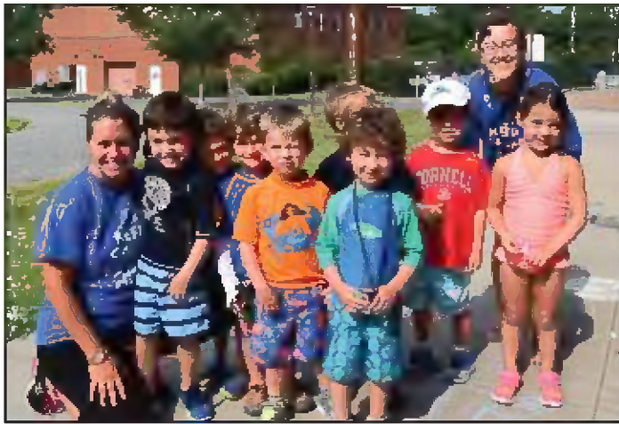
Camp Katan kids.

Visit www.charlottejcc.org to view all fall classes at the Levine JCC. Registration is now open for members and non-members. To enroll in classes, please call 704-366-5007 or visit the Levine JCC Customer Service Desk. ☆