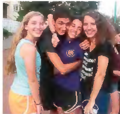
Special discount for early registration.

PART I CHARLOTTE: Welcome Hadera teens and introduce them to the American way of life. Together they will explore Charlotte's Jewish community and all the Queen city has to offer to learn about our cultural differences, tzedakah and leadership.