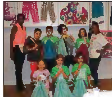
Some of our Seniors show off the tote bags they made at Sew Fun