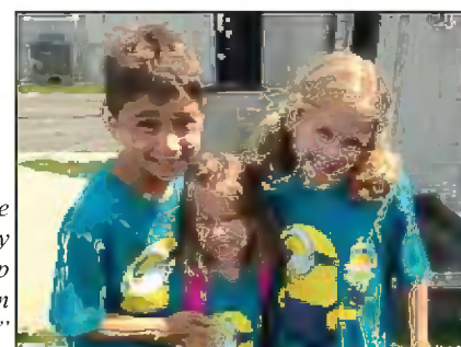
At right, The Weiss family all dressed up for "Twin Day"