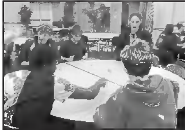
A dreidel contest.

place for teens to share experiences and gain insight into how to cope with being a teen in the 21st Century.