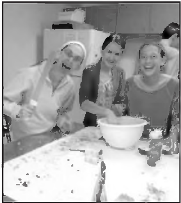
Obviously the cooking class is very serious.

* Forget everything you thought that you knew about Core Classes. This year we are really mixing things up, with new subjects, new groupings, and lots of fun.