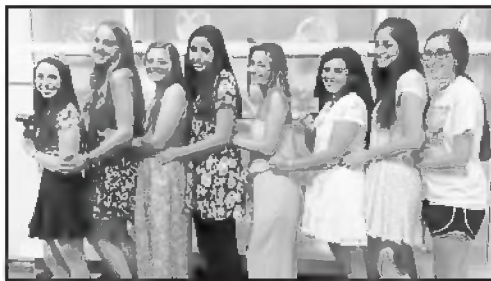
Chai Chaverim BBG board.

* In addition, new members visited the different chapters and got a taste of the unique teen-led programs BBYO offers. We look forward to seeing these new members learning more about BBYO on both the