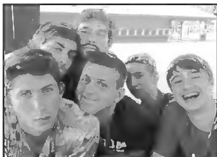
Members of Hank Greenberg AZA are looking for you.

* Nearly 100 teens kicked off the year with a color war event at Camp Mindy. Old friends and new members bonded over games, physical challenges and enjoyed a sweet treat from King of Pops.