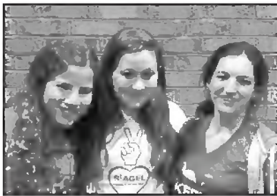
See your favorite friends at Hebrew High on Wednesday nights.

* New electives that are cooperative endeavors with the JCC (Environmental class above) and with JFS. The JFS class (called Reality Check) will explore teen lives and their struggles in contemporary society. Taught by the staff at Jewish Family Services, this will be a non-judgmental