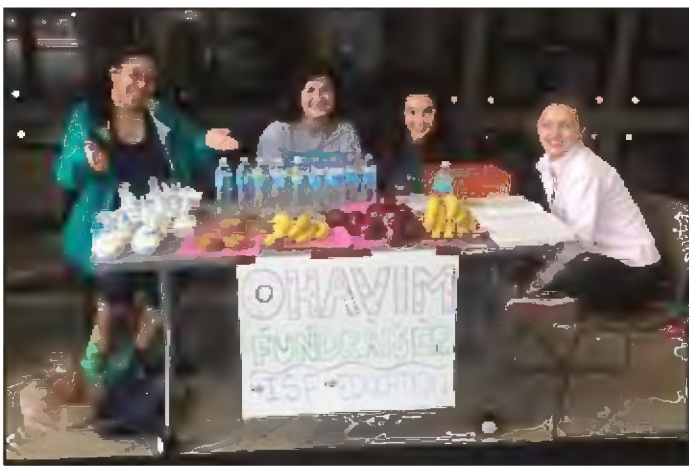
The girls of Ohavim raising money for BBYO's ISF Education Fund.