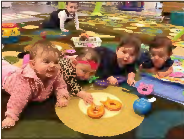
The infant posse.

Questions? Contact Tair Giudice, 704.344.6755, tairjudice@jewishcharlotte.org