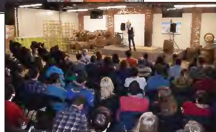
Capacity crowd at Impact 365 Comedy Night