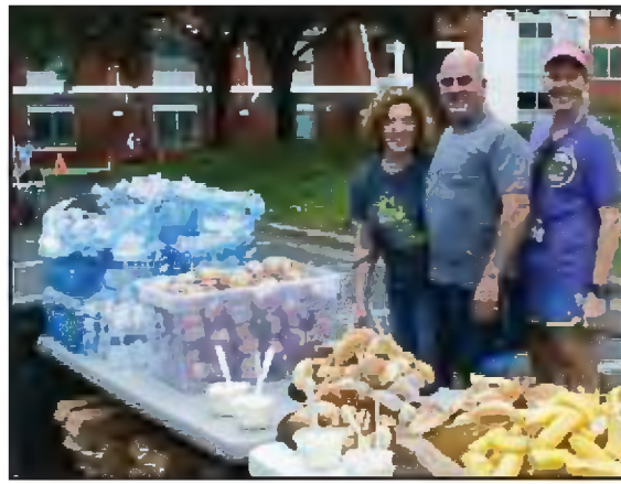
Volunteers at the Friends Run.

Jewish Family Services is honored for the Friends Run to be selected by Carolinas HealthCare System to be featured in their LiveWELL Race Series, a health and wellness program for their 35,000+ employees. "For those who want to take their fitness to a higher level, Carolinas HealthCare System's LiveWELL program offers a race series to its teammates that includes more