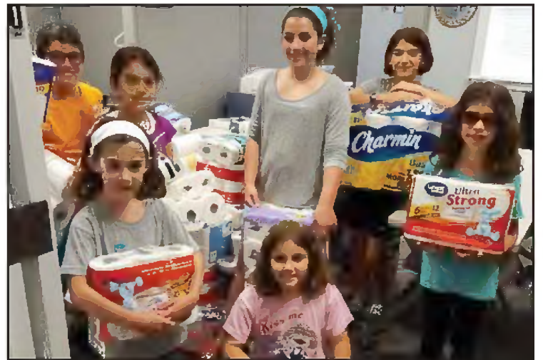
CJDS students with their donations.

We continually seek opportunities to engage the children in tzedakah, giving, caring, seeing that there is a world outside of their circle. The Hospitality Suite of Charlotte requested assistance with the basic staples needed at their house. CJDS agreed to hold a toilet paper drive. Our school bus transported our student council representatives to deliver the toilet paper. We received a lovely thank you from the organization: