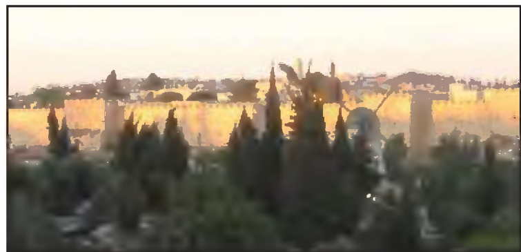
The old city of Jerusalem.

For more information go to www.TKTIsraelTrip.org where you will find a detailed itinerary, pricing information, a slide show highlighting the sites to be visited, and a host of FAQs. To sign up or request additional information, call the Temple's office at 704-987-9980 or email admin@templekoltikvah.org . ☆