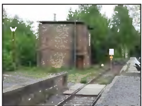
back. When one stands Track 17- deportation track in the middle of an

At the edge of the platform, a small marker with the word MAHNMAL (reminder, exhortation to remember). Along the two platforms in raised letters are the transport number