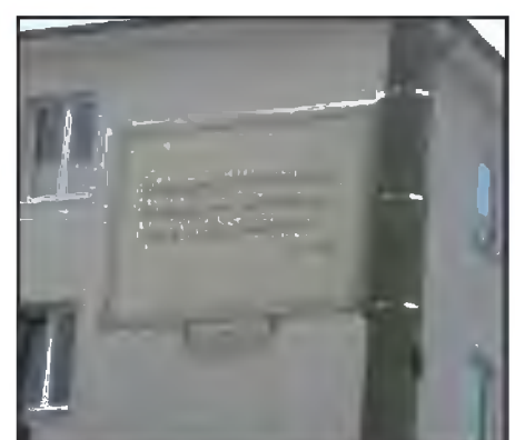
Memorial sign on the lamppost. Translation: "Jews may only shop between 4-5pm. April

In The Village Shops at South Park Just Two Doors Doen from Crate & Barrel 704-364-6543 www.davidsltd.com