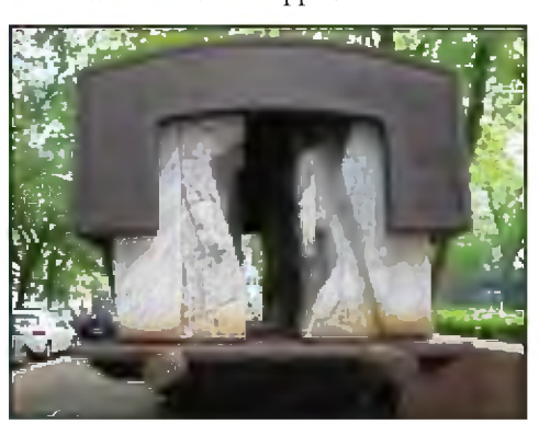
Memorial at Levetzow Strasse

After every one of our excursions we of course stopped a the