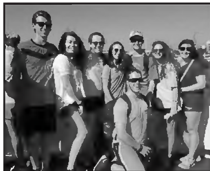
On the ocean in Charleston.

It was so cool to be able to naturally float and cover your body with soft mud. We also went to many informational museums such as the Palmach Museum, the Immigration Detention Camp, the Hall of Independence, and Yad VaShem. I learned so much at all of these places about the history of Israel and Jews around the world. The old city of Jerusalem was when I felt most connected