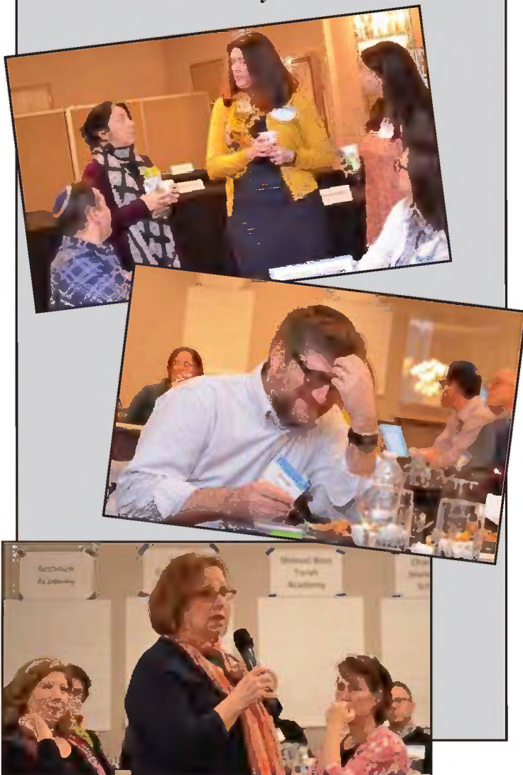
Jewish educators from all over the US attended the Prizmah Governance and Fundraising Academy at Shalom Park, hosted by CJDS