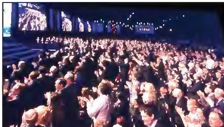
Conference attendance was 18,000 strong.

For those of us who love Israel and support the special bond Israel has with the United States, Policy Conference is a truly amazing experience. As a small town Jew who grew up in Kingstree, SC, I am moved beyond words each time I attend. I met people of every generation and from all parts of the world. I feel privileged to be part of this diverse, bi-partisan AIPAC community, and I cannot wait until my children are old enough to join me in this unique experience.