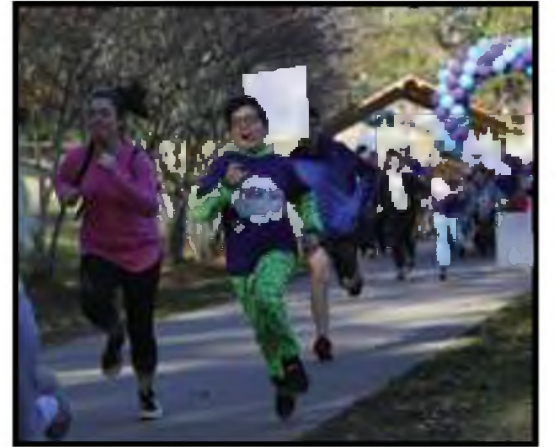
Pajama Walk energy.