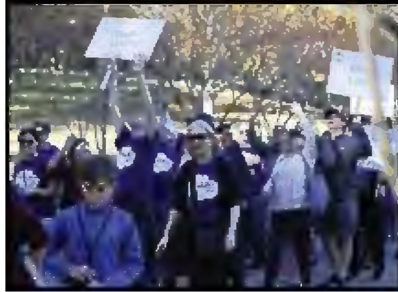
The Pajama Walk begins.

Friendship Circle and ZABS Place are initiatives of Chabad of Charlotte and beneficiary agencies of the Jewish Federation of Greater Charlotte. ✪