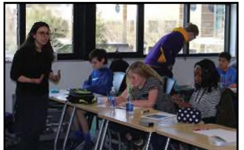
Photos above: Providence Day students cracking the code of friendship.