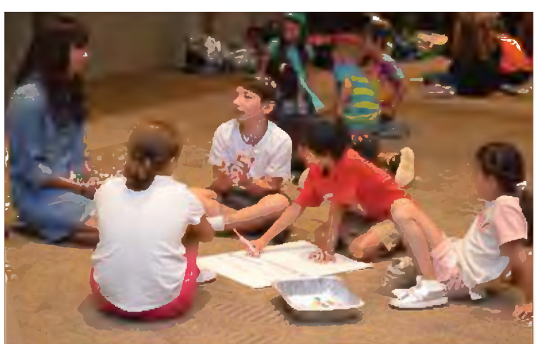
Students make their own posters with rules for being responsible, purposeful, safe, and empathetic.

the children in the school could be reminded of the rules and guidelines and understand what they really mean.