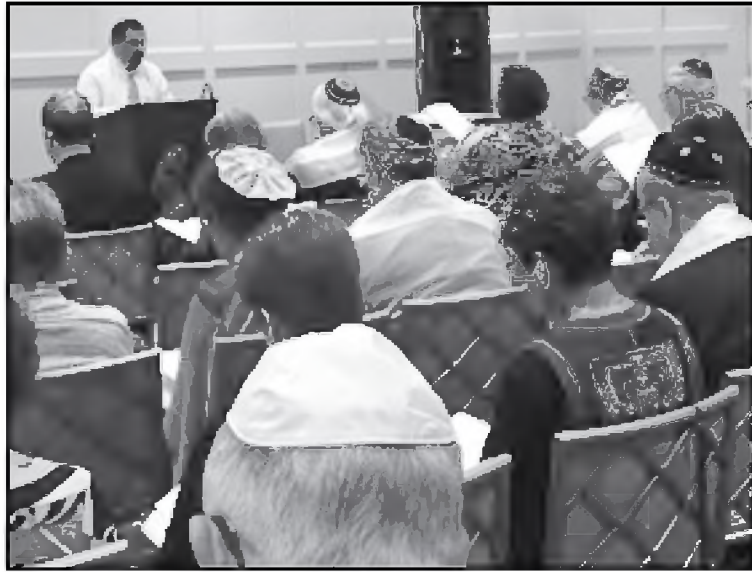
Yom Kippur Services at Carolina Orchards

"Though President Carter knew what a Bar Mitzvah was, nobody else in the room had