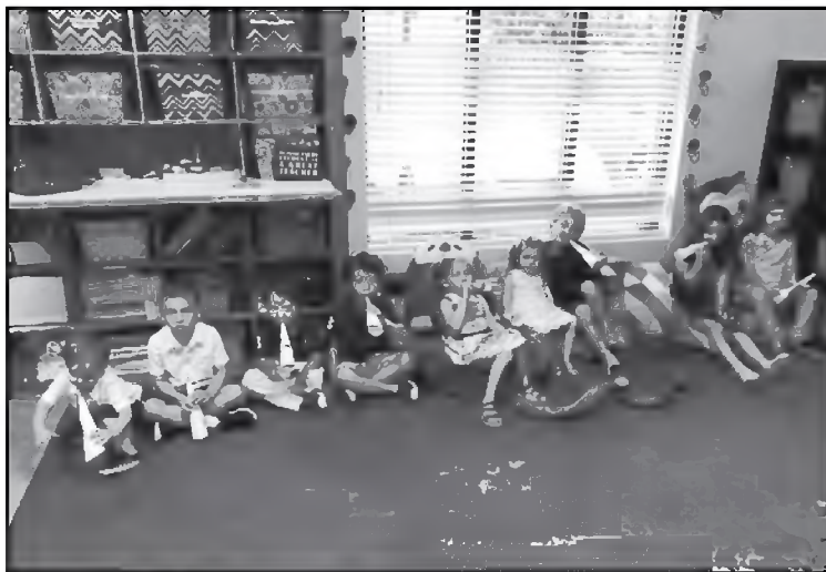
Children with their shofarim

"After welcoming the group and thanking us for coming, one of the first things Jimmy Carter asked each of us was where we were from. The crowd was from all parts of the U.S. No one was