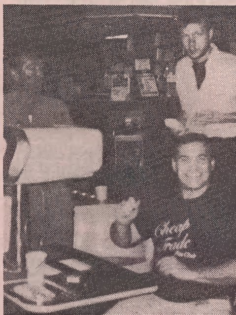
Isn't that special.

"Isn't That Special" is a fun league, enjoyed by all who participate. Come join the league or just come bowl on any Monday night.