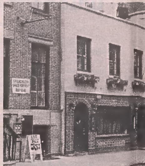
The historic Stonewall Inn in New York City, where riots in 1969 launched the gay rights movement, was declared a National Historic Landmark by the US Department of the Interior.

"...and God bless Daddy and Daddy, and Grandma..."