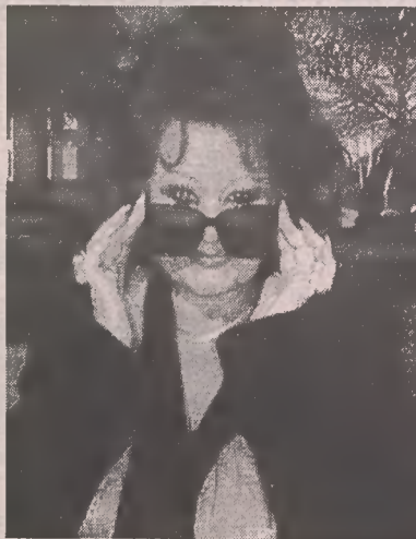
Tammy Faye Bakker Messner returned to the spotlight this year with the release of an autobiographical movie. Messner has returned to live in the Carolinas.