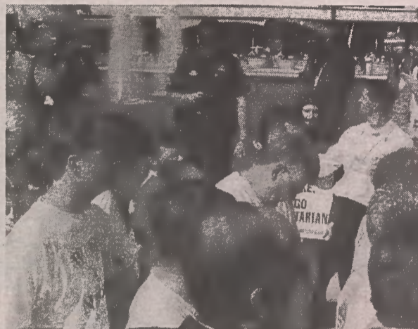
A "Stop Spiritual Violence" campaign organized by Soulforce in conjunction with GLBT advocates within various Christian groups led to hundreds of arrests at national denominational gatherings across the US.

Join us for services each Sunday at 10:45am and 6:30pm 1825 Eastway Drive, Charlotte, NC 28205 (704) 563-5810