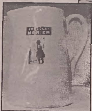
Chocolat Menier Pottery